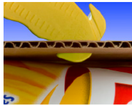
Will not damage packaged goods